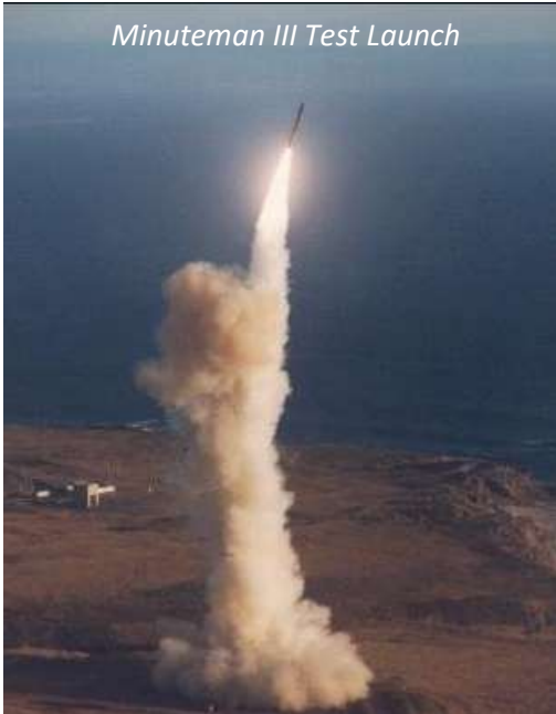
Minuteman III Test Launch