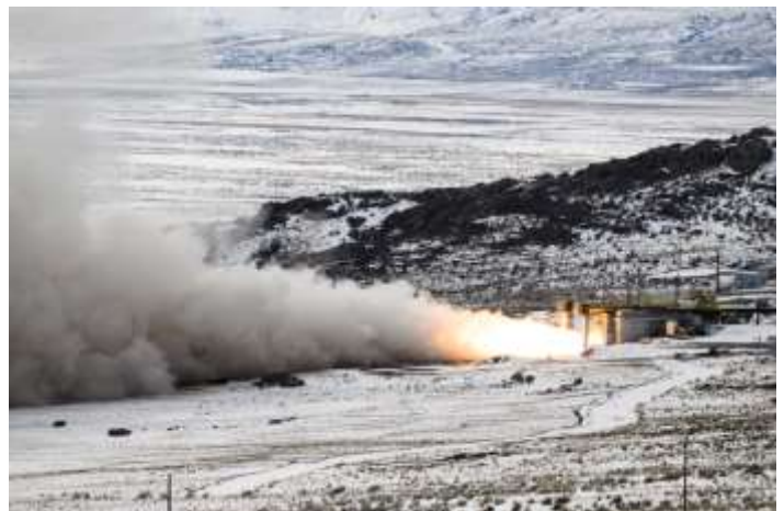
First full-scale static test fire of the LGM-35A Sentinel stage-one solid rocket motor. March 2, 2023.

When addressing the Project Planning and 2024 PA Activity review, a wide variety of issues were discussed in areas of potential effects. Some mitigation efforts accomplished and ongoing are Cultural Awareness Training, photographic records, National Historic Landmark nominations, and developing protocols to request proposals from Tribal Nations regarding ethnobotany (study of tradition knowledge and customs concerning medical, religious, and other uses of plants) and toponymy (study of place names). Included in this discussion was the highlighting of "The Silent Sentinels: Minuteman Artwork Revealed," sponsored by the Association of Air Force Missileers. Two copies were sent to each of the 77 entities associated with the PA.